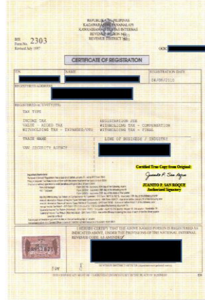
File Name: ABC Company – BIR Certificate of Registration