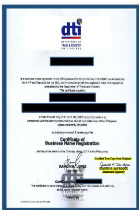
File Name: ABC Company – DTI Certificate of Registration