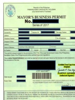
File Name: ABC Company – Mayor’s Business Permit