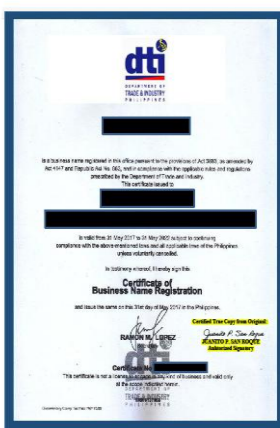
File Name: ABC Company – DTI Certificate of Registration