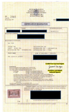
File Name: ABC Company – BIR Certificate of Registration