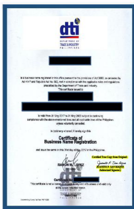
File Name: ABC Company – DTI Certificate of Registration