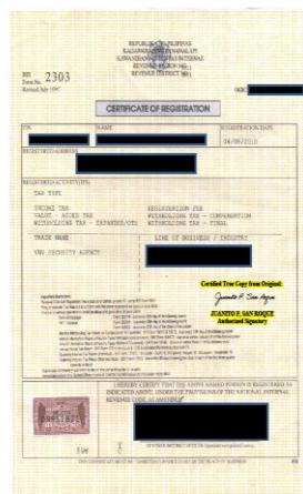
File Name: ABC Company – BIR Certificate of Registration