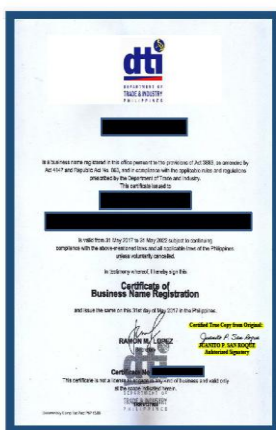
File Name: ABC Company – DTI Certificate of Registration