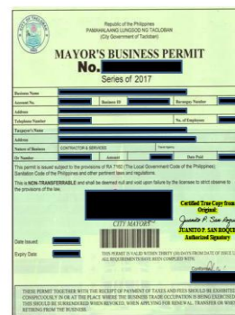
File Name: ABC Company – Mayor's Business Permit