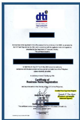
File Name: ABC Company – DTI Certificate of Registration