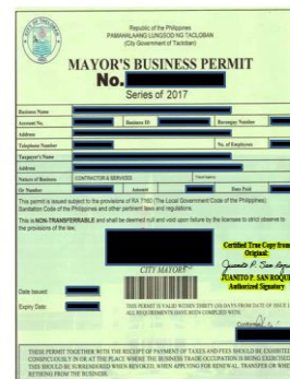
File Name: ABC Company – Mayor's Business Permit