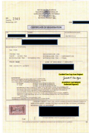
File Name: ABC Company – BIR Certificate of Registration