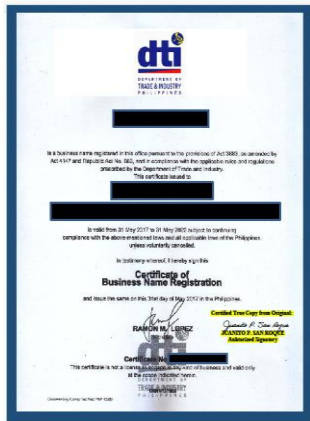
File Name: ABC Company – DTI Certificate of Registration

7.6) The Bidding Documents to be submitted through electronic means should be scanned copies of the original documents in PDF/JPEG file format. Each scanned document must bear the markings " Certified True Copy from Original " duly signed by the bidder's authorized signatory . Each document must be saved in PDF/JPEG file format using this file name format: "Name of Bidder - Title of the Original Document" . Examples are shown below: